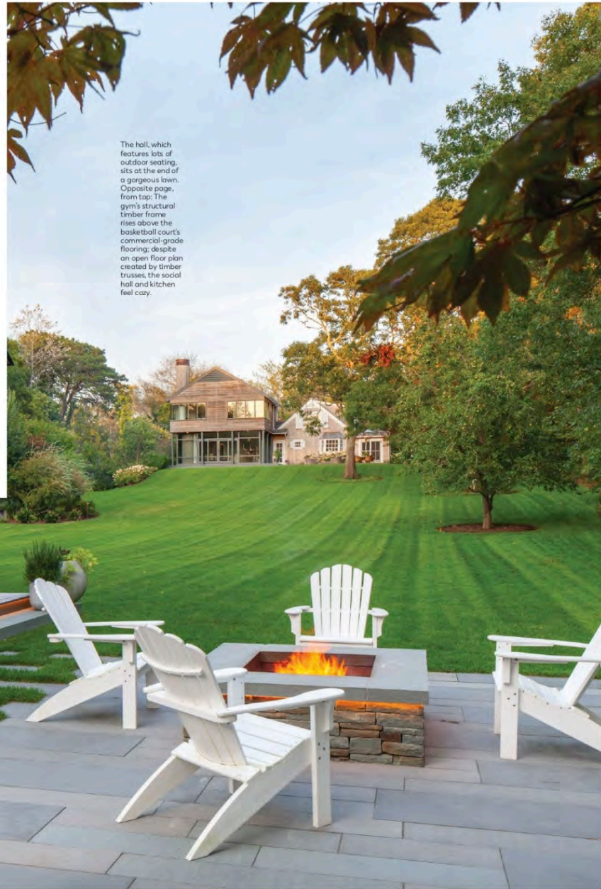
The hall, which features lots of outdoor seating, sits at the end of a gorgeous lawn. Opposite page, from top: The gym's structural timber frame rises above the basketball court's commercial-grade flooring; despite an open floor plan created by timber trusses, the social hall and kitchen feel cozy.