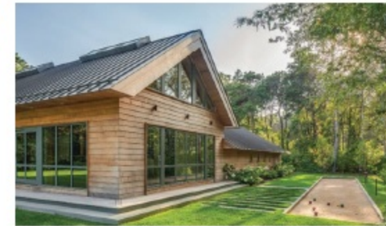
From top: The main house, an older Cape with a contemporary addition, is located across the field; a bocce court is shrouded by the site's plentiful mature trees.