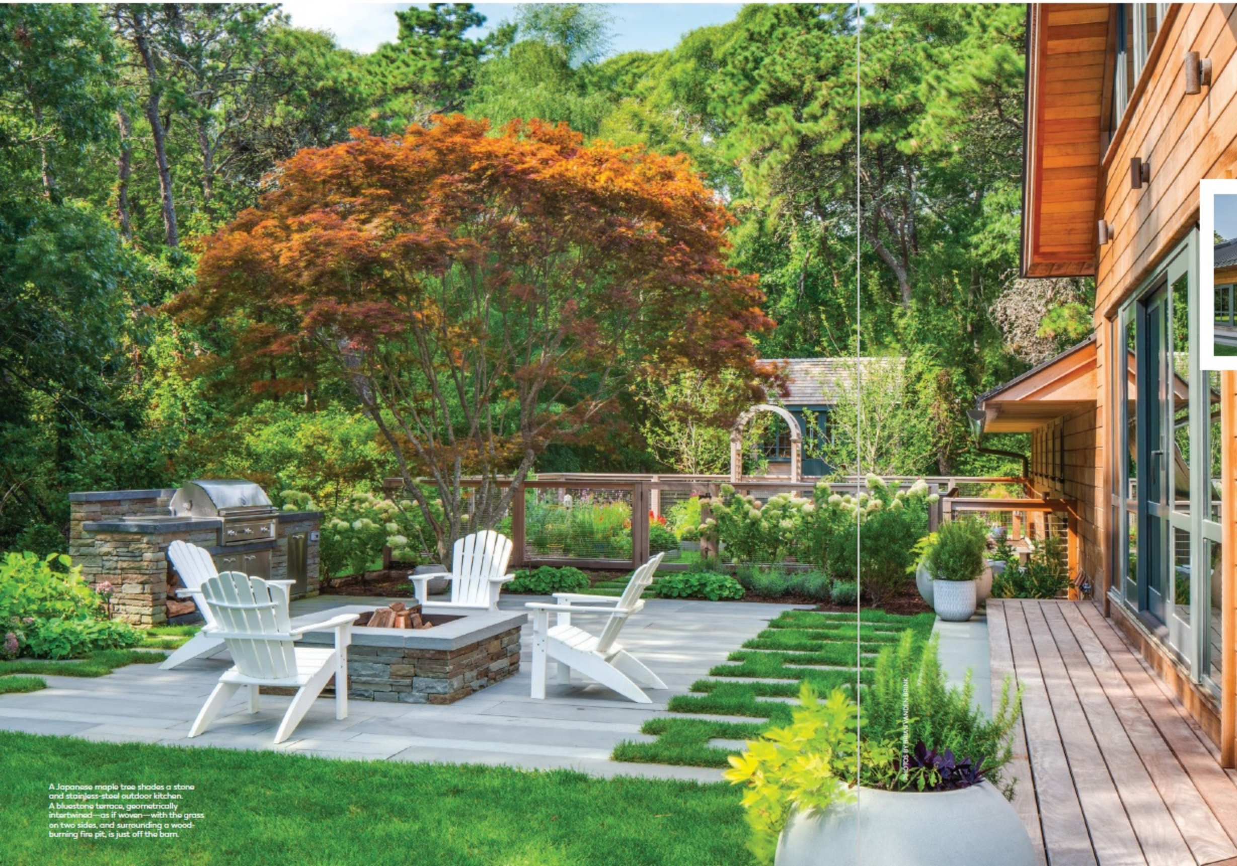
A Japanese maple tree shades a stone and stainless-steel outdoor kitchen. A bluestone terraca, geometrically intertwined—as if woven—with the grass on two sides, and surrounding a wood-burning fire pit, is just off the barn.