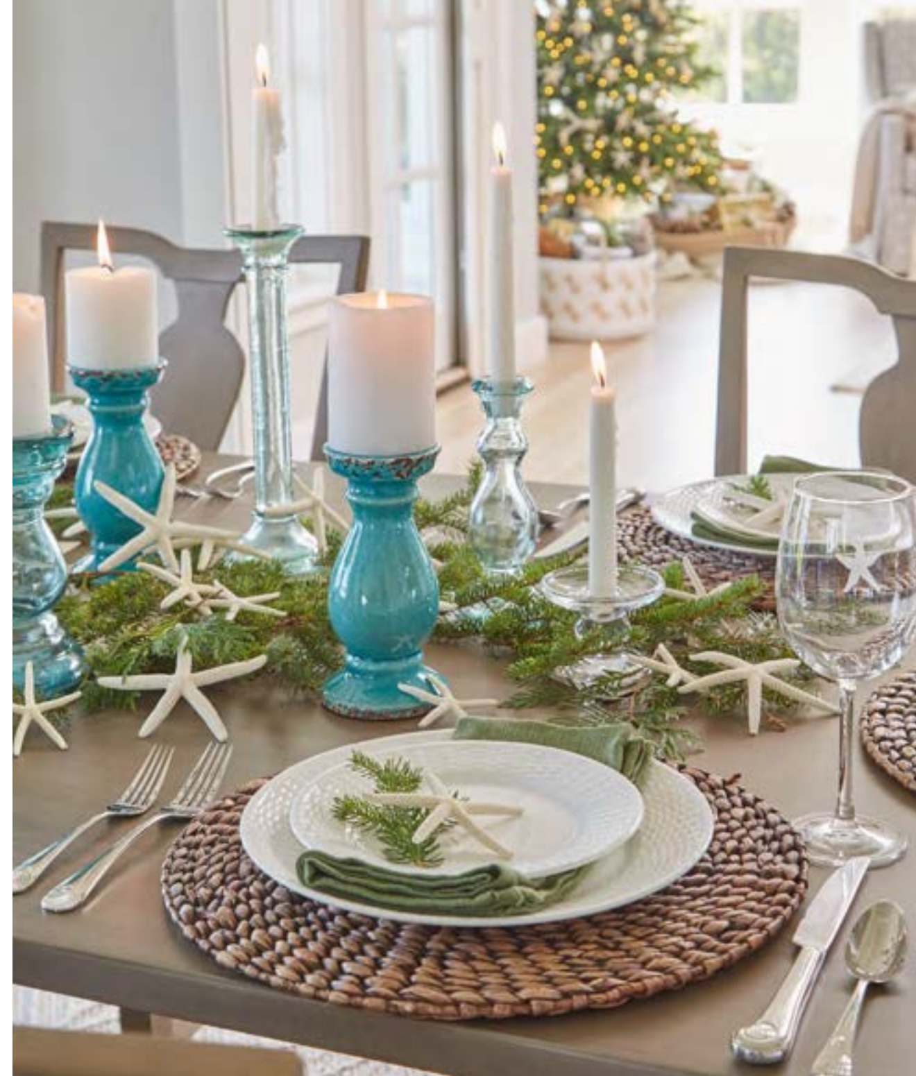
Starfish tucked in with small cuttings of pine sit under a playful assortment of candlesticks. Colors of seaglass and blue ceramic candlesticks are reminiscent of the ocean.

Opposite: The Mayflower Wooden cellar basket, $175