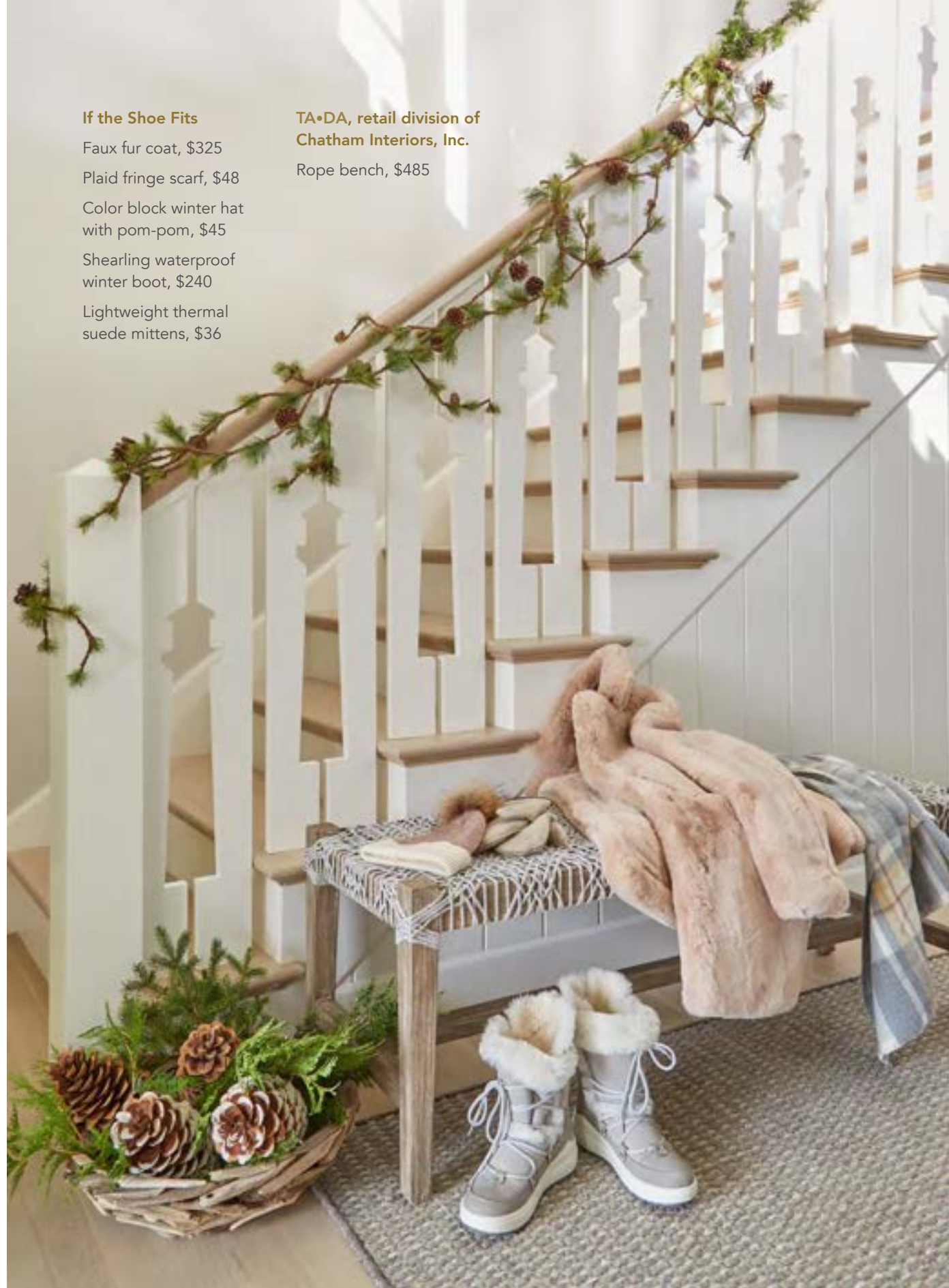
Seaside-inspired details, such as the lighthouse cutouts along the stairway, add to the home's character. The house is filled with abundant light throughout the day.

The kitchen, designed by Classic Kitchens & Interiors, provides a beautiful space for entertaining.