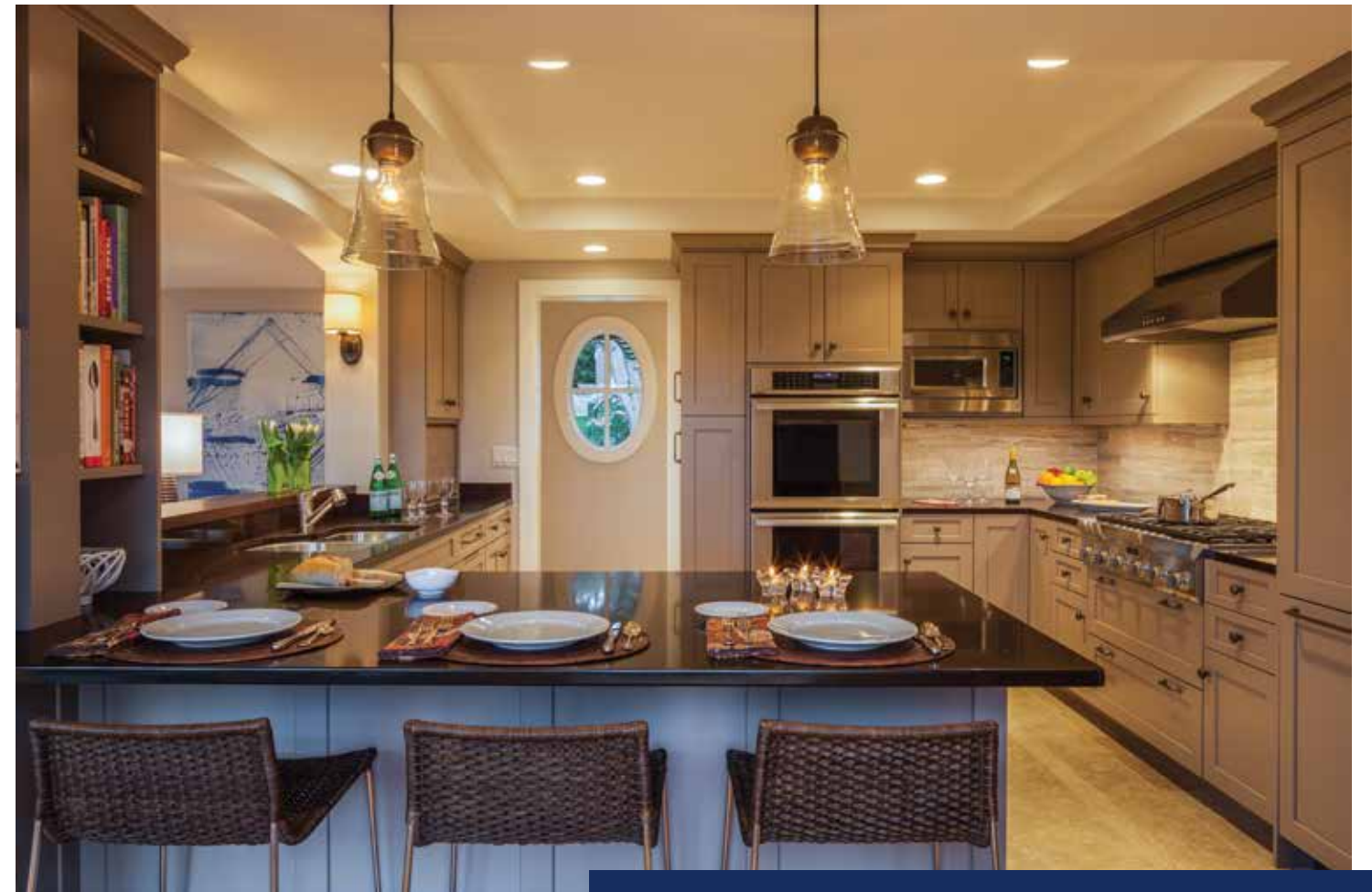
The interior spaces (master bedroom opposite top, mudroom opposite bottom left, master bath opposite bottom right, kitchen this page top and bottom) are designed to take advantage of light and views from multiple directions. The kitchen design is by Classic Kitchens & Interiors of Hyannis.