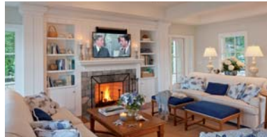
Cohesive and jubilant, the interior design has a breezy, maritime air.